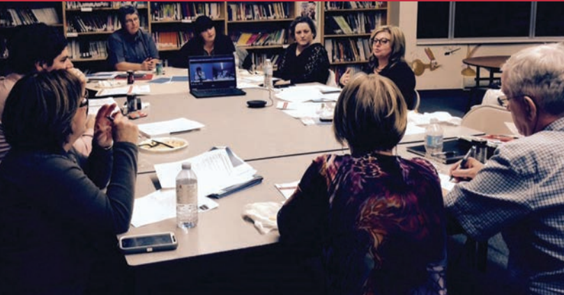
Citizens' Committee on French-Language Health Services in South Eastern Ontario, Trenton