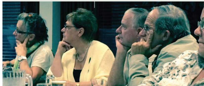
Focus group on the Champlain LHIN's Integrated Health Services Plan, Casselman

in the region have been newly identified. The Western Ottawa Community Resource Centre and Addiction and Mental Health Services of Kingston, Frontenac, Lennox and Addington will begin developing new French-language services to be offered to the Francophone population.