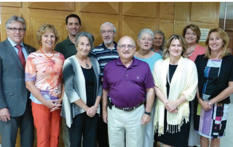
Board of Directors 2015-2016