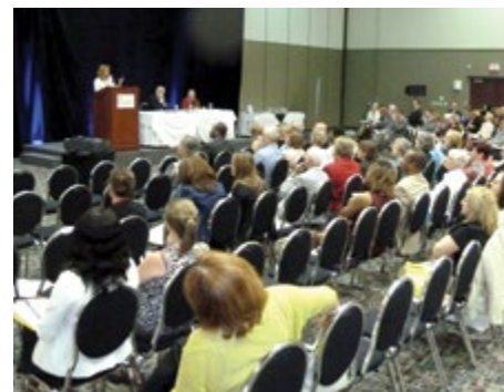
Annual General Meeting 2014 – 15 th Anniversary, Ottawa, May 2014